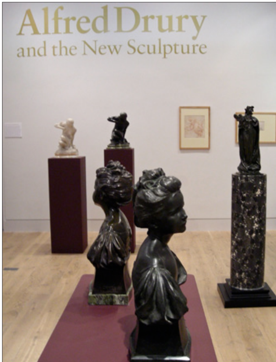
Fig. 5: Installation photograph of 'Alfred Drury and the New Sculpture' in the Stanley & Audrey Burton Gallery, University of Leeds, 2014.

Exhibitions, however, always pose problems when judged as art history, notably because the works of art available to display may achieve a prominence that exceeds their art-historical significance. 11 Arguably, the