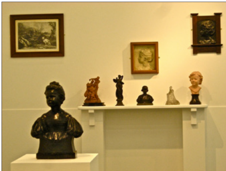
Fig. 3 : Installation photograph of 'Alfred Drury and the New Sculpture' in Studio 3 Gallery, University of Kent, 2013.

As it was finally realized, the tableau of 'The Studio' was not a straightforward facsimile of the photograph of Drury's Gunter Grove studio, but a creative response to it ( Fig. 3 ). On a mantelpiece (skilfully constructed by the University of Kent's estates maintenance team) were placed a smaller terracotta version of The Triumph of Silenus (1885) to the one in the photograph, the bronze statuette of Spring (1890), a small bronze version of Griselda (1896), Dalou's plaster model of a Praying Peasant Woman (1877), which was in Drury's original arrangement, and a terracotta bust of a Boy's Head (c. 1887), which was not. Drury's best-known work, The Age of