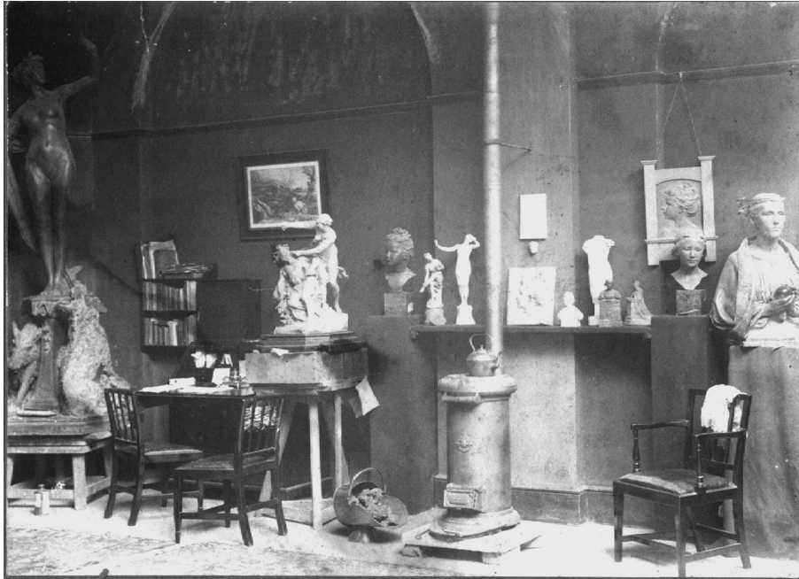
Fig. 1: Photograph of Alfred Drury's studio in Gunter Grove, London, c. 1900.

A second photograph (Fig. 2) records Drury presenting his model for the Elder memorial to a group of clients, probably led by John Alexander Cockburn who was the Agent-General of South Australia in London at this time. 3 Circe , an Alphonse Legros etching hanging on the wall, and Drury's terracotta Triumph of Silenus of 1885 can just be made out in the background of this second photograph, demonstrating that the two photographs are closely related and were taken on the same occasion.