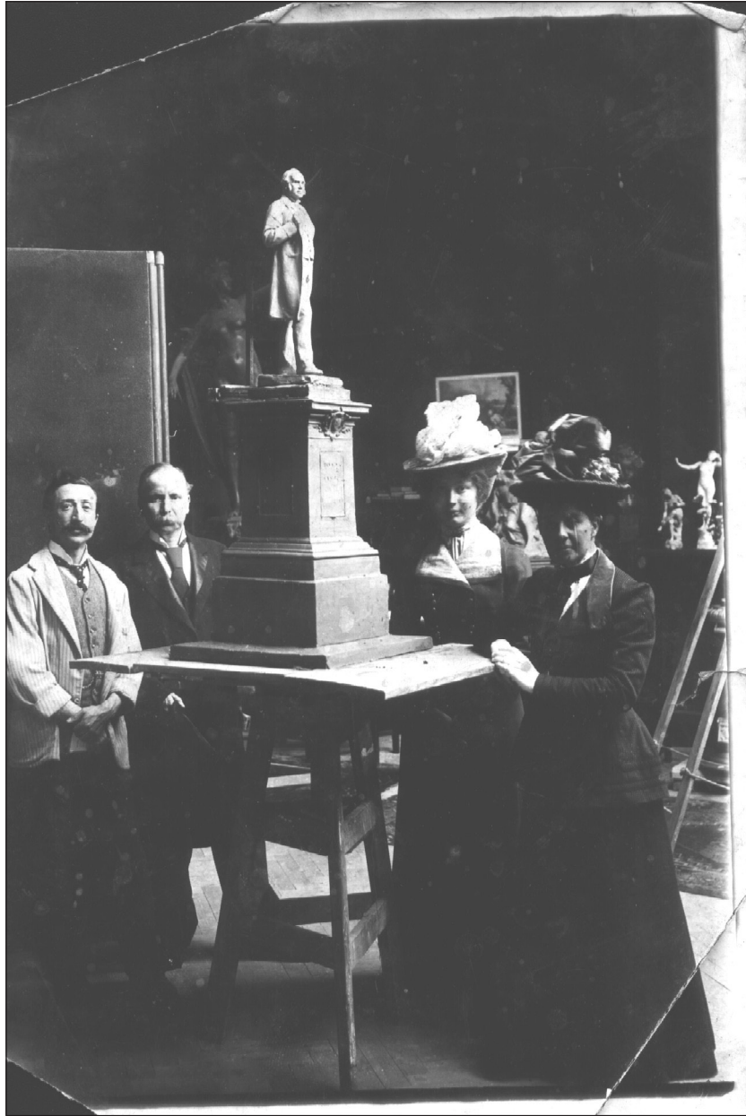
Fig. 2: Photograph of the Thomas Elder Memorial Committee in Alfred Drury's studio, c. 1900.

In a sense, the photograph of the studio display is the nearest thing we have to a visual record of an exhibition of Drury's works curated by the artist himself. In this arrangement he demonstrated the range of his accomplishments, from exhibition pieces to more modestly sized works intended for the home; he tolerated the replication of different versions of the same