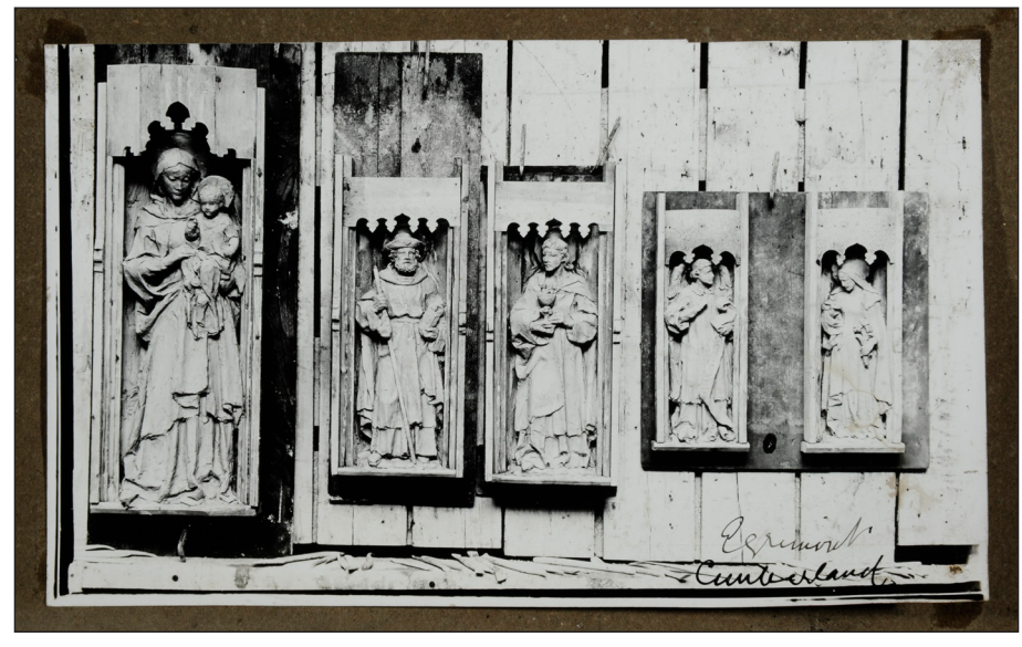
Fig. 4 : Nathaniel Hitch, Photograph of a clay and wood model for the reredos for the church of St Mary & St Michael's in Egremont, Cumbria. 1999.1 Photograph album of the sculpture of Nathaniel Hitch and others, c . 1890–1930, Henry Moore Institute.