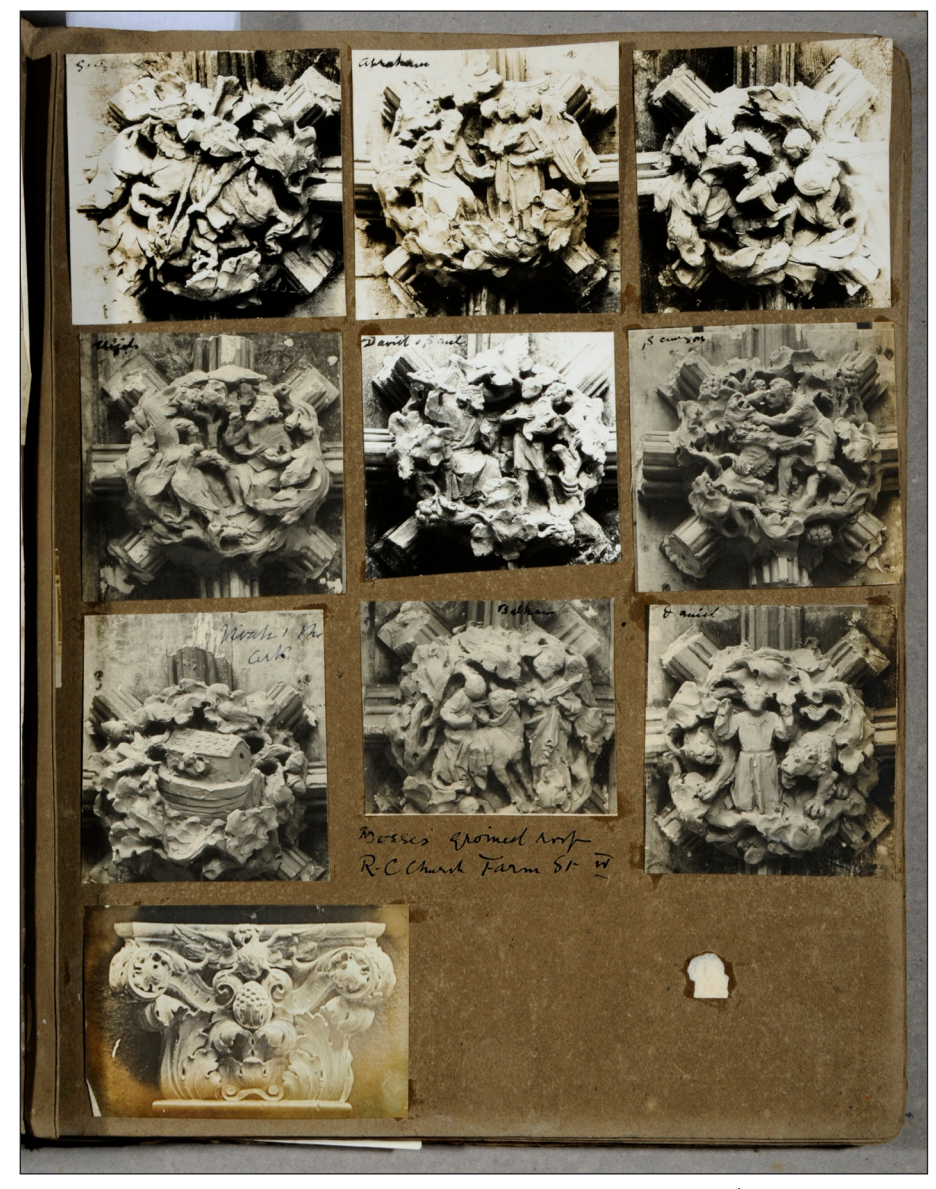
Fig. g : Nathaniel Hitch, Photographs of clay models annotated 'Bosses groined roof R.C. Church Farm St W'. 1999.1 Photograph album of the sculpture of Nathaniel Hitch and others, c . 1890–1930, Henry Moore Institute.

style. The church was completed between 1844 and 1849, and its extensive polychrome decorative scheme includes a high altar designed by Pugin.<sup>29</sup> Hitch's photographs are of clay models for architectural bosses,