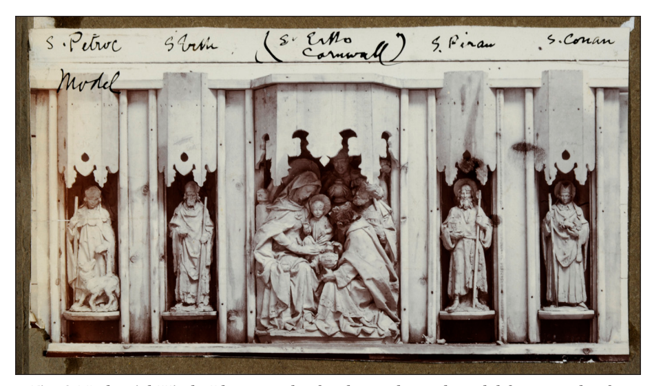
Fig. 6 : Nathaniel Hitch, Photograph of a clay and wood model for a reredos for St Erth's parish church in Cornwall. 1999.1 Photograph album of the sculpture of Nathaniel Hitch and others, c. 1890–1930, Henry Moore Institute.

plaster cast. Damp cloths would have kept the clay sufficiently moist during works, particularly if they were operating in adjacent workshops. The relationship between the clay model and the final work can be seen in the following two photographs ( Figs. 6, 7 ). The first documents Hitch's clay model for a reredos for St Erth's parish church in Cornwall; the second, the