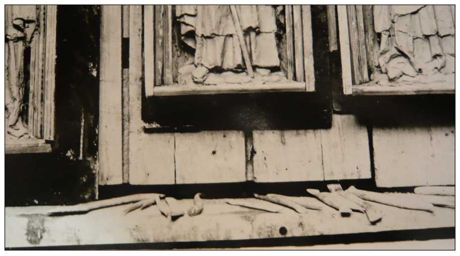
Fig. 5 : Nathaniel Hitch, Photograph of a clay and wood model for the reredos for the church of St Mary & St Michael's in Egremont, Cumbria (detail). Note the modelling tools on the shelf. 1999.1 Photograph album of the sculpture of Nathaniel Hitch and others, c. 1890–1930, Henry Moore Institute.

working on all five works simultaneously. The tools indicate that Hitch worked the clay block in situ , almost like direct carving, creating a sculpture from within its architecturally defined space.