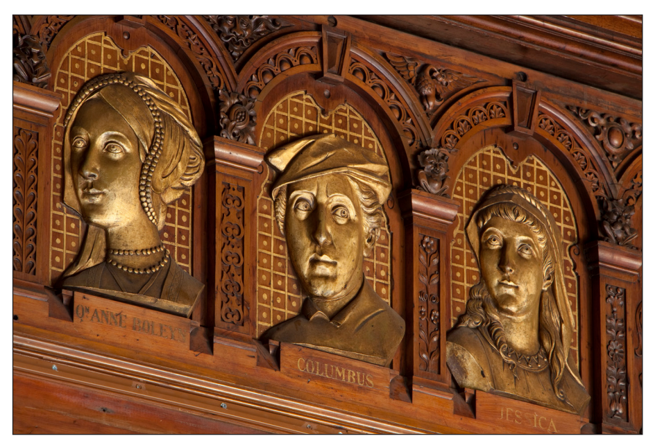
Fig. 2 : Nathaniel Hitch, Relief portraits for Lord Astor at Two Temple Place, c. 1894–96. Two Temple Place, London.

Claire Jones, Nathaniel Hitch and the Making of Church Sculpture 19: Interdisciplinary Studies in the Long Nineteenth Century, 22 (2016) <a href="http://dx.doi.org/10.16995/ntn.733">http://dx.doi.org/10.16995/ntn.733</a>