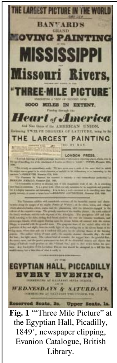
Fig. 1 “Three Mile Picture” at the Egyptian Hall, Picadilly, 1849’, newspaper clipping, Evanion Catalogue, British Library.

conception of our brethren of the Western world – a natural result of the giant forms of nature by which they are surrounded’. 3 The Lady’s Newspaper of London, writing about Banvard’s panorama after it came to England, reinforced this formula: