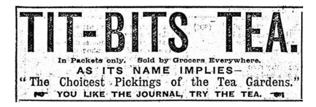
Fig. 4: Display advertisement for 'Tit-Bits Tea'. Tit-Bits, 1 June 1895, p. iii.