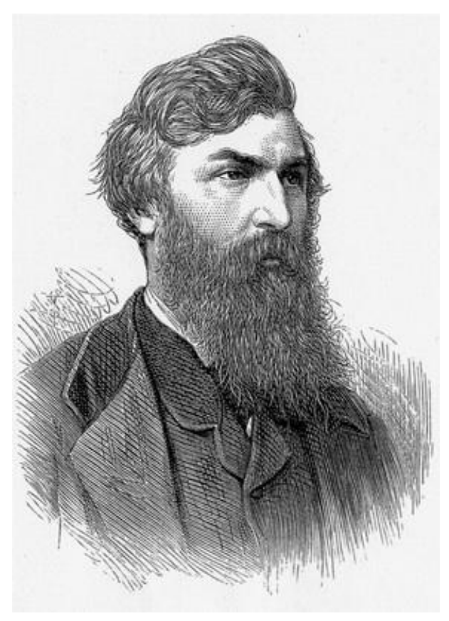
Fig. 1: Portrait of E. S. Dallas. Illustrated

With regard to readership, Dallas suggests that journal subscriptions represent not passive consumption of print commodities but rather forms of voluntary combination akin to public associations created to achieve specific social ends. This is expressed in terms deriving from de Tocqueville in his study of American democracy, which argues that a newspaper 'can only subsist on the condition of publishing sentiments principles or common to a large number of men', and therefore 'always represents an association which is composed of its habitual readers'. 14 Thus, Dallas states that the press should be conceptualized not as 'a London News, 8 February 1879, p. 129.