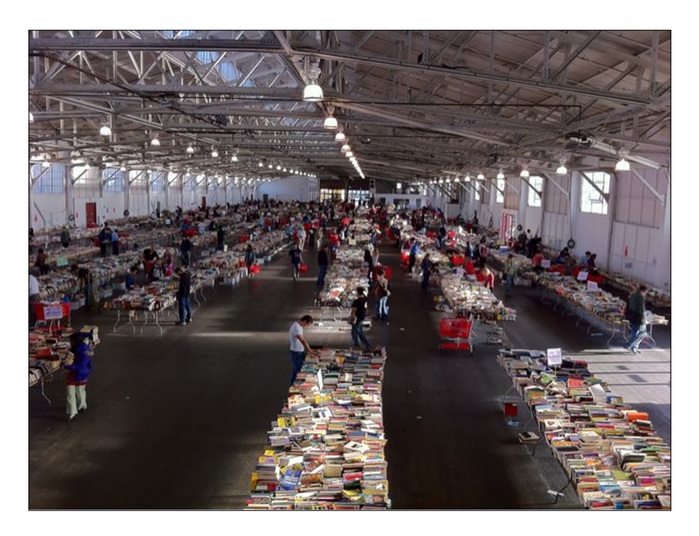
Fig. 6: 200,000 books donated by the Friends of the San Francisco Public Library (2011).

perverse effect of crippling access. We need new systems but, in the meantime, the best way to be read is to not charge each reader for access.