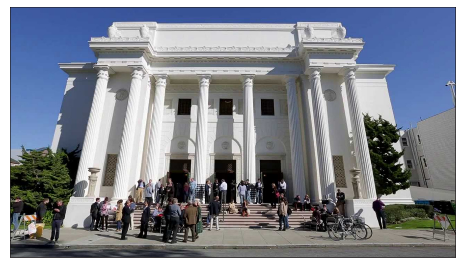
Fig. 1: A former Christian Science church, the Internet Archive's headquarters is located at 300 Funston Avenue, San Francisco.

Though the Internet Archive is more than a nineteenth-century research library, it is one of the largest repositories of digitized nineteenth-century materials in the world. It is difficult to imagine doing research in nineteenth-century studies without using the Internet Archive . Freely available, the Archive 's holdings, its multiple digitized copies of single books, its interface with its word search, uploading and downloading functions, sound application, and beta-feedback are invaluable to nineteenth-century scholars worldwide. And the impact of the Internet Archive on teaching is just as important, both inside and outside the classroom.