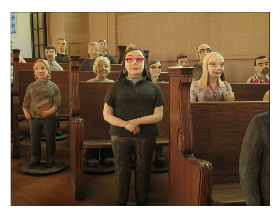
Fig. 5: Terracotta archivists at the Internet Archive . This artwork is based on the terracotta army of Qin Shi Huang and is the Internet Archive way of thanking those archivists who have served at the organization for at least three years.

Currently, we are funding limited. But given the funding (ten cents a page), I believe we can get access to the collections in the great libraries. But then we must also preserve the physical versions. Fortunately that is getting cheaper as well — if most of the access is to the digital versions, then the physical versions can be stored more densely and safely. We do not need to be deaccessioning as much as we have been because it is less expensive to save materials. The Internet Archive now has two large physical archives where we are storing over one million books, and tens of thousands of films, records, and microfilm reels. This can and should be done by everyone. But if others cannot store them, we hope they will think of us ( Fig. 6 ).