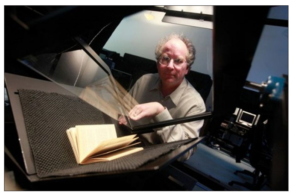
Fig. 2: Brewster Kahle.

As a regular user of the Internet Archive , it seems to me that in addition to preserving digital history, the Archive 's mission is also to translate and preserve our hard culture into digital format. Is that the case and, if so, is it working? Are there pitfalls?